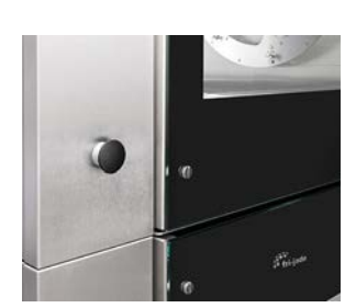
Rotor button on customer side