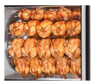
Large display section