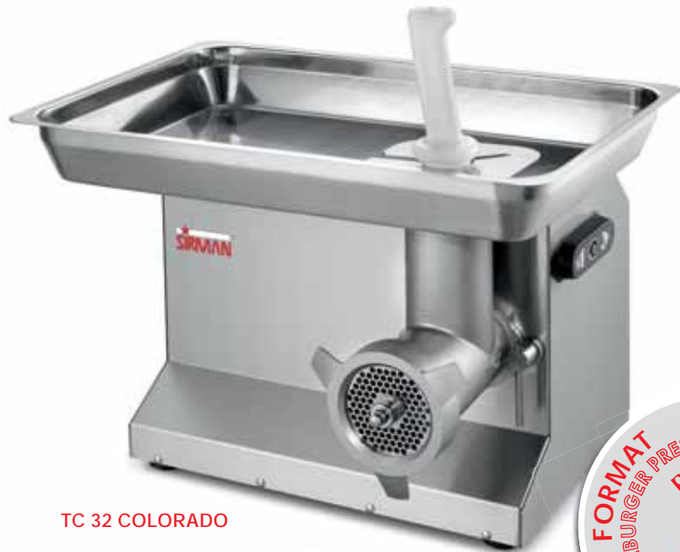
TC 32 COLORADO