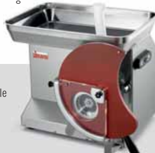
TC 22 COLORADO CON HAMBURGATRICHE

1. Format M. opzionale Optional Format M