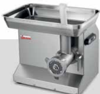
TC 22 COLORADO

1. Format M. opzionale Optional Format M