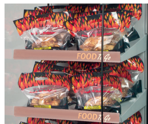
Price strips per shelf