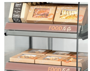
Keeps hot food at 65°C