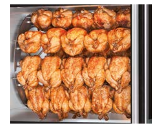
Large product view