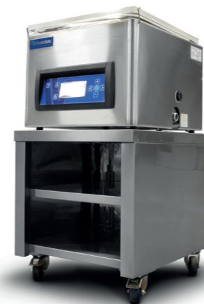
CABINET FOR T2, T3 & T4