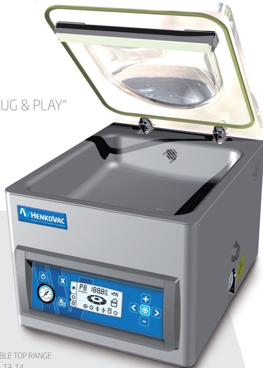
TABLE TOP RANGE T2, T3, T4