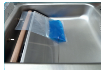
Liquid insert plate